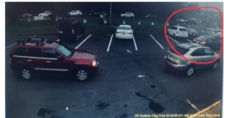
View of School Parking Lot from School Camera System