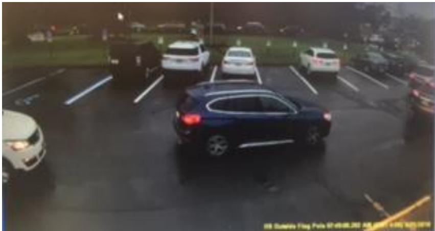
View of School Parking Lot from School Camera System

Some of the matters can be addressed relatively easily with signage/road striping, while others will require financial investment from the Borough and Board of Education.